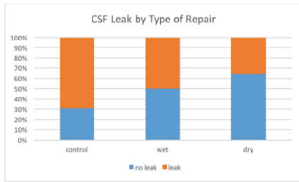
Fig. 3 Results: cerebrospinal fluid leak rates. Control to wet, p = 0.15 , control to dry, p = 0.04 , wet to dry, p = 0.22 ; significance defined as p < 0.05 .

reconstruction arms. The days between the creation of the defect and fluorescein injection (healing time), averaged 25.5, 27.1, and 27.3 days, respectively, for the three groups. Baseline weights and change in weight over the study period were recorded. There were no differences among the groups calculated by an analysis of variance (ANOVA).