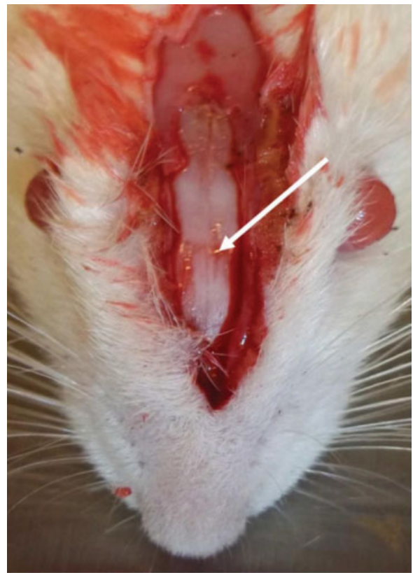
Fig. 1 The nasofrontal suture line (arrow) was identified to orient an anterior skull base defect, created using a Dremel rotary tool. Left- and right-sided defects were evenly created within each group.

The animals were divided among three reconstruction arms. To minimize technical bias, the reconstruction groups were interspersed throughout surgery days and not performed sequentially. Right- and left-sided defects were assigned evenly among reconstruction groups. All the surgeries were performed by a single researcher. One-third of