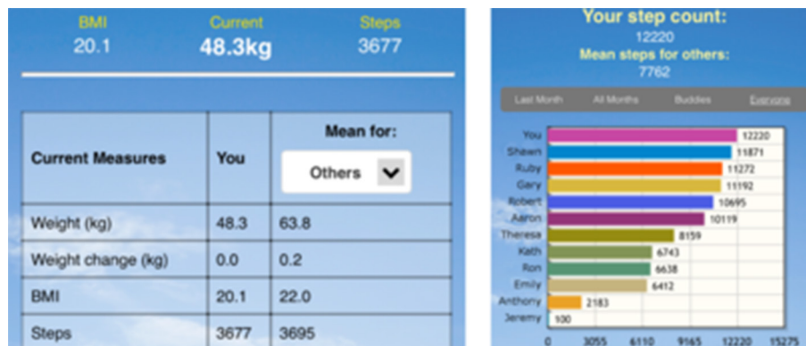
Figure 3 Screenshots displaying the social comparison features in fit.healthy.me.

(independent of the day). In contrast, the value for steps is a daily measure (ie, it is reset to zero at midnight every day) and the value retrieved from the API by fit.healthy.me at any given point correspond to the last time the Fitbit Flex 2 bracelet was synced that day.