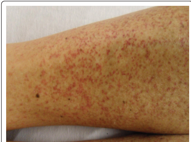
Figure 2 Skin lesion of the patient on lower extremities. Generalized palpable purpuric rash on lower extremities.

immunofluorescent technique showed rare colloid bodies with antibodies to IgG and IgA, trace granular basement membrane staining with antibodies to C3 and trace basement membrane staining with antibodies to IgM. With these clinical and laboratory results he was diagnosed with a case of adult onset HSP and was initially treated with intravenous methylprednisolone 125 mg every 8 hours for one day and intravenous isotonic fluids. There was marked improvement of abdominal pain. Skin lesions gradually faded away and rectal bleeding resolved. After nephrology evaluation of acute kidney injury, along with proteinuria and hematuria, he underwent a kidney biopsy which demonstrated IgA mesangioproliferative glomerulonephritis with less than 50% crescents. Oral prednisone tapering was continued to complete the six months of steroid therapy. Acute kidney injury and