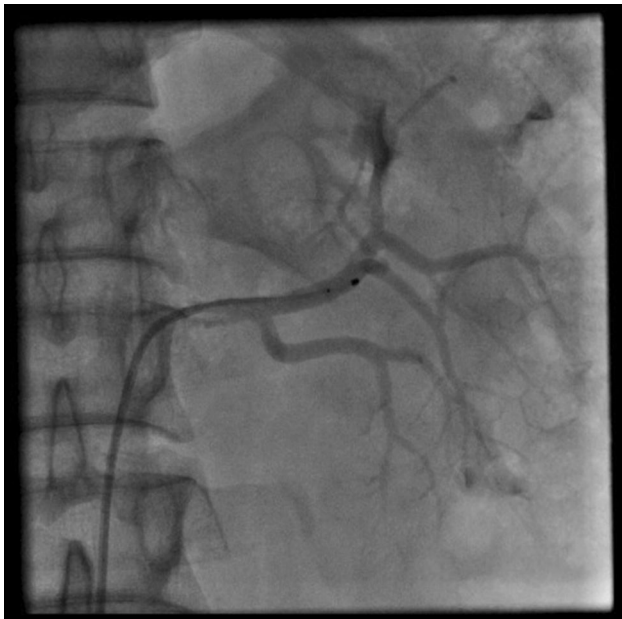
Fig. 1 Symplicity Catheter ® in the left renal artery. It was possible to perform five ablations in the left renal artery

Due to his uncontrollable blood pressure percutaneous renal sympathetic denervation using the Symplicity Catheter ® system was performed as described previously [5], with five ablations in left and six in right renal artery (Fig. 1). The patient was discharged the following day on his pre-ablation antihypertensive regimen. The only complication of the procedure was transient stenosis of both arteries resulting from artery spasm and edema.