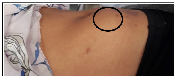
Figure 1. An ill-defined hard mass measuring approximately 10 x 10 cm.

A 17 years old female presented to a local hospital with a gradually progressive lump and pain in the lower abdomen for 4 weeks. On abdominal examination there was an ill-defined hard mass measuring approximately 10 x 10 cm palpable in the lower abdomen (Figure 1).