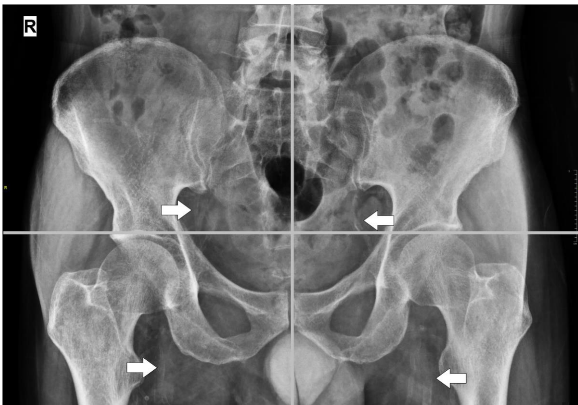
Figure 1. Pelvis graphy- iliac and femoral arterial calcifications.