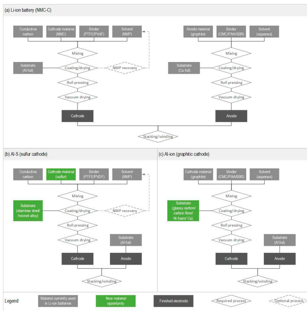
Figure 2. Electrode production requirements for (a) a Li-ion battery with NMC cathode and graphitic anode; (b) an Al-S battery with sulfur cathode and aluminum anode; and (c) an Al-ion battery with graphitic cathode and aluminum anode. Abbreviations: NMC—lithium nickel-manganese-cobalt oxide, PTFE—polytetrafluoroethylene, PVDF—polyvinylidene difluoride, NMP— N -methyl-2-pyrrolidone, CMC—carboxymethyl cellulose, PAA—polyacrylic acid, and SBR—styrene butadiene rubber.