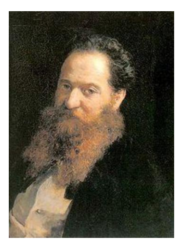
Figure 1. Moritz Schiff, circa 1860.

The production and fate of bile salts engaged many scientists. In 1860 Schiff proposed his solution to the problem. He returned the excreted bile, collected via a fistula, into the duodenum and demonstrated definitively the re-absorption of bile salts from the intestines in a positive feedback loop. In a much later experiment, he fed guineapigs ox bile salts and showed their presence in the excreted bile of the other species. The "Schiff biliary cycle" was thus established as an eponym (Figure 1).<sup>5,6</sup>