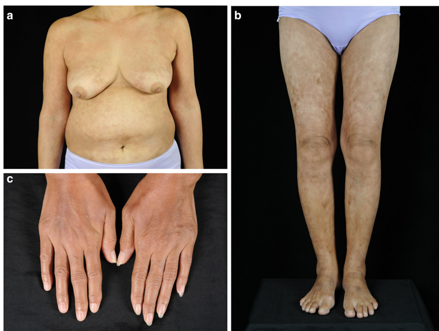
Fig. 1 Clinical presentation. a, b Widespread reticulate hyperpigmentation over the trunk and extremities with discrete erythematous indurated plaques over the chest wall and anterior abdomen, c Sclerodactyly with cool periphery of all fingers