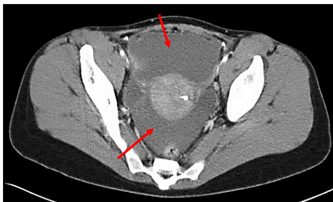
Fig. 1. CT of the pelvis (axial view) showing free fluid in the pelvis.

On examination, the patient was anxious and diaphoretic. Vital signs revealed tachycardia at 100 beats/min., but were otherwise normal. GCS score was 15/15 with no sensory or motor deficits. Abdominal examination revealed a contusion to the mid-epigastric area, and severe diffuse tenderness with rebound and guarding especially in the epigastric area and left upper quadrant. Head and neck examination revealed midline neck tenderness, but no obvious facial trauma. Chest examination revealed right sided tenderness with ecchymosis under the right breast, and breath sounds were normal bilaterally. Laboratory investigations revealed a white cell count of 12,900/mm 3 , haemoglobin level of 17.1 g/dL, amylase of 231, lipase of 80, and normal transaminases. Plain X-rays of the chest were negative. CT of the head and neck were negative. CT of the abdomen and pelvis was performed and revealed large amount of free fluid in the abdomen and pelvis (Fig. 1). The density of the fluid was not suggestive of blood with an attenuation coefficient of 40HU. There was no visceral injury detected and the fluid source was unclear at this point.