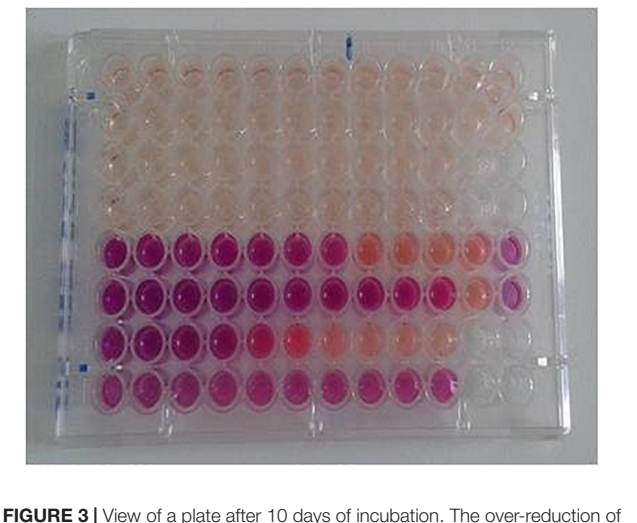
FIGURE 3 View of a plate after 10 days of incubation. The over-reduction of resazurin has yielded the uncolored product hydroresorufin.

During the preliminary experiments there was an observation that resazurin solution was reduced very easily, even before the addition of the fungal inoculum. An effort was made, to keep already prepared plates, loaded with diluted drugs as well as with the colored solution, at -20^{\circ} C. The results were disappointing, since resazurin was already reduced when the plates were took out of the freezer. Similar results were obtained even if the colored solution remained in the plates for 2–3 h before loading the inoculum. Thus, the decision made was to add the resazurin