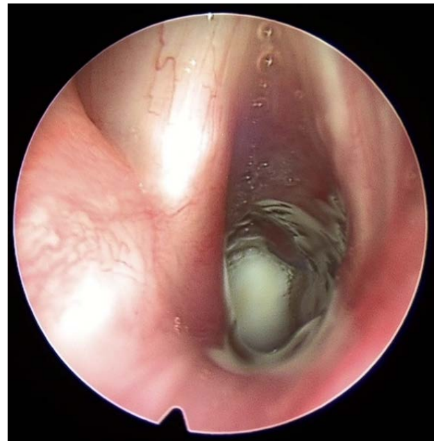
Fig. 4 Postoperative endoscopy of the larynx, 13 days after surgery

The airway was subsequently investigated endoscopically 13 days after surgery (Fig. 4). It showed a good respiratory laryngeal subglottis, so the patient could be decannulated. 6 months after tracheostomy closure, the patient remained symptom free and came annually for monitoring.