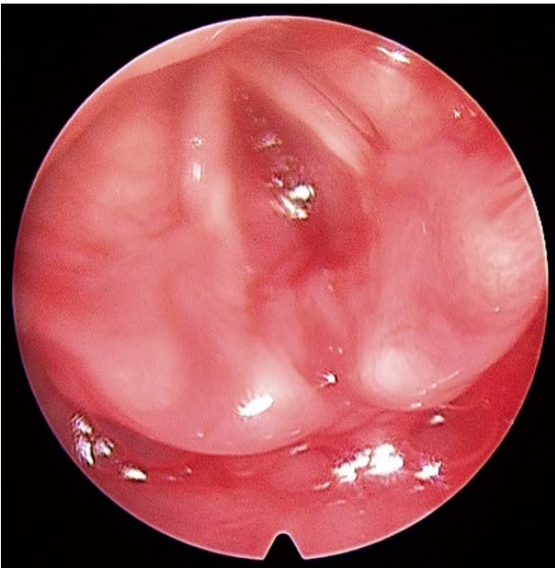
Fig. 1,2 Subglottis completely obstructed, in spite of a large opening of the vocal cords free margins

Intraoperatively, no mucosal stricture/ stenosis could be elicited at the subglottic level. Instead, a concentric narrowing of the whole subglottic region was observed (Fig. 3).