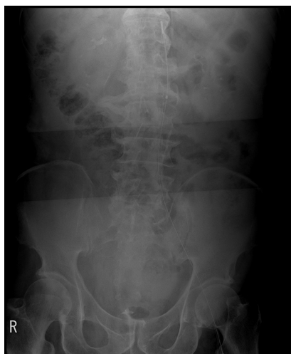
Figure 2 Radiograph showing infrarenal resuscitative endovascular balloon occlusion of the aorta in zone 3. Zone 3 of aortic occlusion corresponds to the lowest area below the renal artery above the aortic bifurcation.

retroperitoneal hemorrhage (RPH) revealed active bleeding from the right external iliac artery (EIA) at the site of sheath insertion and a huge retroperitoneal hematoma ( Figure 1 ). Unfortunately, the patient's systolic blood pressure reduced further to 50 mmHg after the CT scan, and he developed cardiac arrest. We performed manual compression of the puncture site and chest compressions.