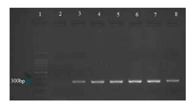
Fig. 2. Analysis of the HAdVs Lane 1: 100-bp size marker Lane 2: Negative control Lane 3: Positive control Lane 4-8: samples

of infectious conjunctivitis in different regions of the world (19). It is the commonest cause of viral conjunctivitis and EKC in ophthalmic clinics in several societies, especially in East and Southeast Asia. Subgroup D adenoviruses including type 8, 19, 37 and adenovirus type 11 (Subgroup B) are the predominant viruses isolated in each endemic outbreak in a different region of the world (20-23).