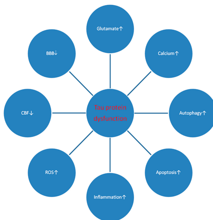
Figure 2. Potential regulatory mechanisms of dysfunctional tau protein in post-ischemic brain neuropathology. ↓ - decrease, ↑ - increase. BBB–blood–brain barrier, CBF–cerebral blood flow, ROS–reactive oxygen species.