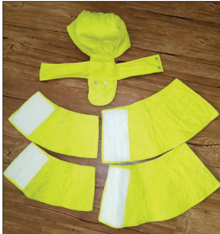
Figure 2: Designed evaporative local cooling coats

such as using a button instead of adhesive fabric tape to adjust the neck coat and change the width of the neck cooling coat were applied. Finally, the area of the cooling coat of the head, neck, wrists and ankles was calculated. To prepare a prototype of cooling coatings, the 50 th percentile of anthropometric data was used as a medium size in the design of cooling coatings.