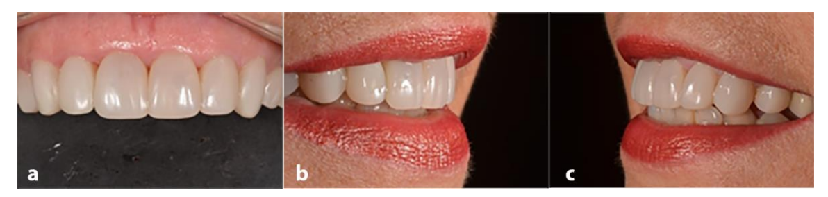
Figure 3. Final aspect of case 2. Facial view (a). Right side view (b). Left side view (c).

Recently, two systems of PCRV were proposed. The Direct Veneer (Edelweiss, Wolfurt, Austria) was developed in 2009 and the Componeer (Coltene) in 2011.<sup>24</sup> Both systems presented PCRVs produced under laboratory conditions. It is inferred that the treatment used in the manufacturing of the Componeer could result in a high degree of conversion of the composite. In theory, this polymerization can promote an increase in the density of cross-linked double bonds