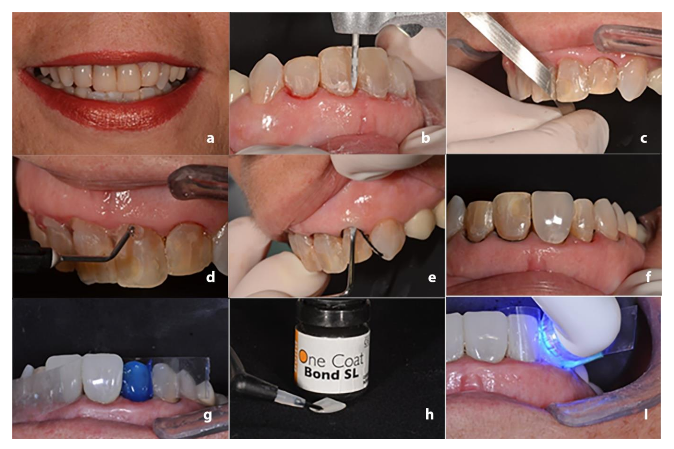
Figure 2. Case 2. Initial aspect (a). Preparation of tooth (b). Interproximal wear with abrasive stainless-steel strips (c). Application of hemostatic gel (d). Insertion of retraction cord (e). Dry proof of PCRV (f). Acid etching (g). Application of adhesive on the PCRV (h). light-curing with LED (i).

corroborate to the satisfactory results obtained.<sup>2,3,9</sup> A well-known veneer alternative is based on the use of direct composite resin. This technique provides a high reproduction of details due to the greater number of composite with different shades. However, some drawbacks such as color instability associated with the difficulty to execute the restoration, render this technique a hard work for the dentist. In the present study the use of PCRVs was simple and effective in meeting the patient's need in only one session.