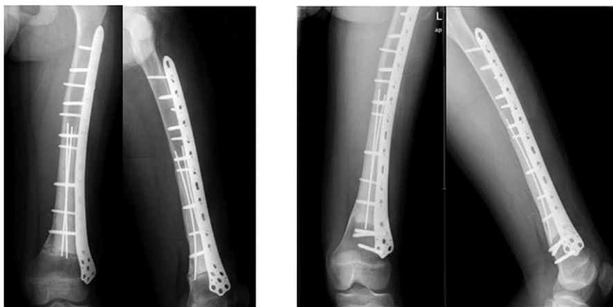
FIGURE 4. (A) Approximately 105 weeks after surgery radiography showed that the distal end of the plate had moved superior to the epiphysis along with bone growth. (B) Locking screws were placed in the distal part of the LISS plate to stabilize the re-implanted bone.

In our review of the literature, we found 5 retrospective studies that examined epiphysis preservation surgery in children with lower limb osteosarcoma. 19–23 Autograft bone was used