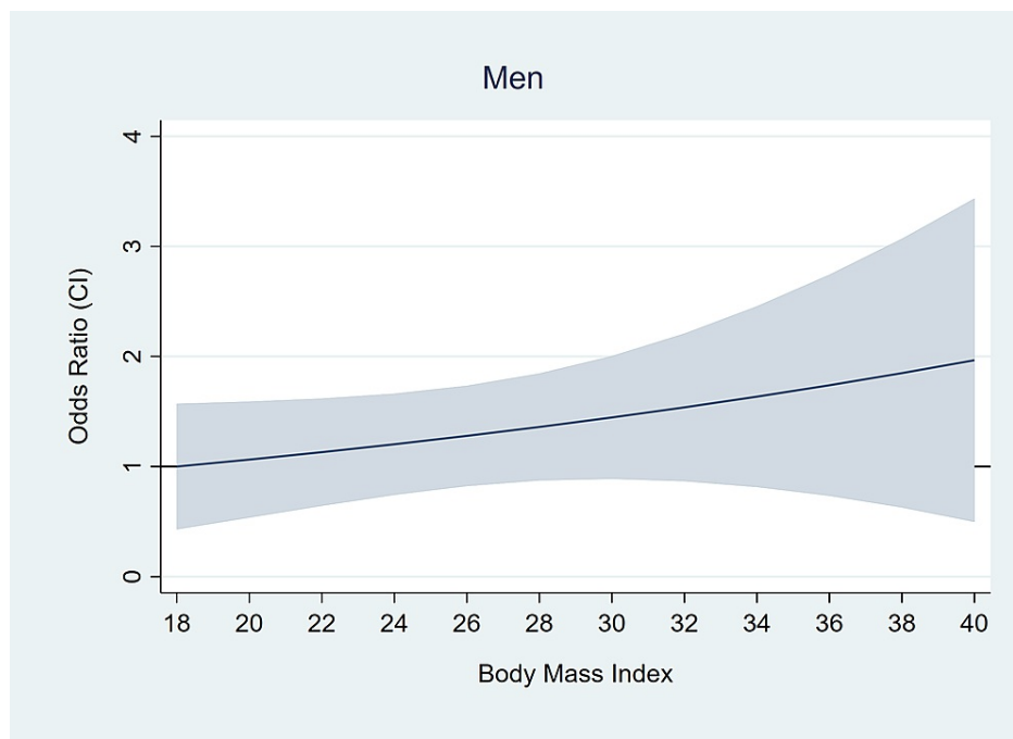
FIGURE 3: Age-adjusted odds of in-hospital mortality with increasing BMI in men.