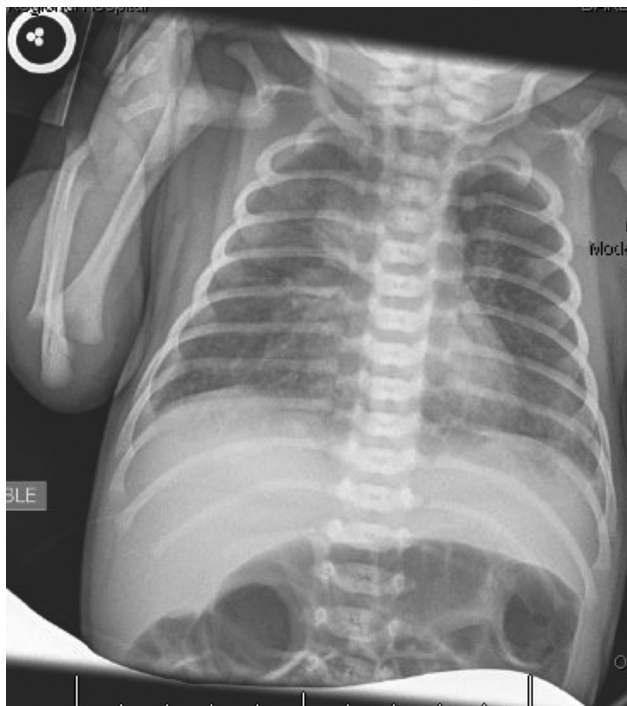
Fig. 1 Infant chest radiograph at 8 hours demonstrating multiple pulmonary opacities.

Upon quaternary NICU admission, laboratory studies revealed lactic metabolic acidosis, leukopenia with severe neutropenia (absolute neutrophil count: 500 \times 10^9/L ), and thrombocytopenia (platelet count 111 \times 10^9/L ). There was no coagulopathy or evidence of other end organ dysfunction. Chest radiograph revealed continued infiltrates (→Fig. 1). At 12 hours of incubation, the blood culture grew gram-negative rods. Evaluation for other infectious foci included lumbar puncture, urinary catheterization, and tracheal aspiration. Cerebrospinal fluid analysis showed normal white blood cell count (17 cells/ \mu L ; 3% neutrophils, 2% lymphocytes, and 95% other cells), elevated red blood cell count (258 cells/ \mu L ), normal protein and glucose con-