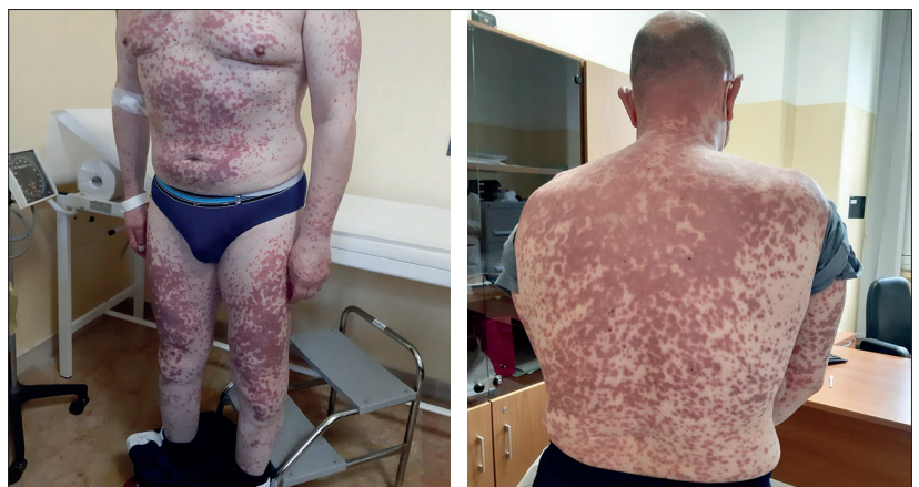
Figure: Purpura in patient 1