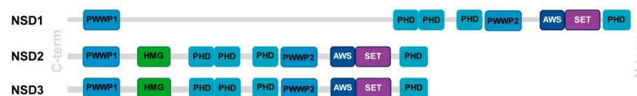
Figure 1. Schematic representation of NSD family proteins basic structure: PWWP, methylation-binding domain; PHD, Plant HomeoDomain; SET, histone methyl transferase domain; AWS, domain associated with the SET domain.

NSD1 and NSD2 are crucial for proper murine embryonic development, since their knockouts are embryonic lethal [65,66], and NSD3 is critical for correct neural crest development [67,68]. In humans, congenital heterozygous mutations of NSD1 cause Sotos syndrome, a severe developmental defect occurring in 1/14,000 births and causing excessive growth, advanced bone age, a characteristic face, neurological disorders, brain