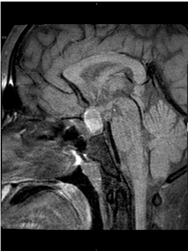
Figure 2 MRI T2 image (frontal view) sellar/suprasellar mass that was isohyperintense with peripheral hyperintensity

1.8×1.5×1.3 cm in size) with haemorrhage and a mass effect on optic chiasm.