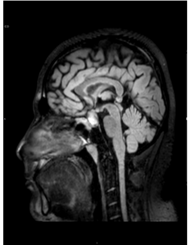
Figure 3 MRI T1 image (sagittal view) non-contrast fat saturated showing fluid level