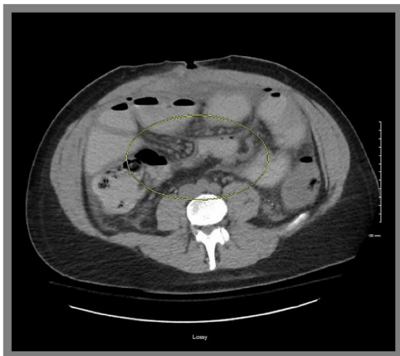
Fig. 3. CT on POD 3 showing a possible transition point in the distal ileum, approx. 6 cm from the cecum.

able to walk around, however, that night the wound dehisced. The patient was brought back to the OR where it became apparent that the PDS sutures had come undone. The staples were removed, and the wound reopened for inspection. Upon inspection, there were no concerns of contamination or infections neither of perforations nor other pathologies. The small bowel was again dilated and needed to be decompressed to be able to close the entry site. An enterotomy was performed on the distal ileum resecting two cm in the process. Finally, a double-barreled decompressive ileostomy was placed to prevent the reoccurrence of any obstructions. After closing the patient, he recovered in stable condition.