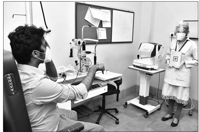
Figure 2: Examiner with personal protective equipments testing the distance visual acuity with visual acuity App for a participant

A total of 68 participants (39 males) were recruited. The mean ± SD age of the participants was 36 ± 11 years, (range 20-60 years). Wilcoxon sign ranked test showed no significant difference (P = 0.315) in distance acuity between Peek Acuity and COMPlog. Significant difference (P = 0.002) was observed