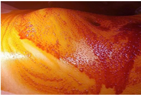
Fig. 1: On the abdominal wall, the bump depending on the cyst below the umbilicus

A 12-year-old female patient was brought to Department of Pediatric Surgery, Firat University School of Medicine, Elazig, Turkey in 2017. She had been suffering from abdominal pain in her suprapubic region for one week. In her physical examination, a lump having smooth surface was determined underneath the skin in the suprapubic region (Fig. 1). It was swollen, tense, partially firm and movable. The diameter of the mass was measured approximately 10 cm. Her hemogram and blood biochemistry were within the normal ranges. There was opacity in the standing direct abdominal radiograph (Fig. 2).