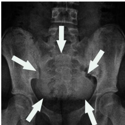
Fig. 2: Radioopaque area in the standing direct abdominal radiograph

Considering the ultrasonography (US), there was anechoic cystic lesion with the sizes of 6.5x9.1 cm in her bladder superior. The thickness of the cyst wall was 2 mm and the vascularisation was not monitored on the wall. The differential diagnosis was mesenteric cyst, lymphocyst, and urachal cyst because of its existence in the midline. In MRI of the lower abdomen, a cystic mass, which completely filled the midline from the promontorium to the anterior abdominal wall, was determined (Fig. 3). It was pure cystic, contrasted, and measured as 9.7x7.8 cm (mesentery cyst?). The mass caused ondulation on the muscles of the anterior abdominal wall. Preoperative intravenous cefotaxime and metronidazole were started. Due to the early diagnosis of mesenteric cyst, laparoscopy was applied at the beginning of the surgery. The cystic mass was not in the intraabdominal, it was seen in the urachal area of the anterior abdominal wall over the periton. Approximately 300 cc of cyst fluid was emptied with an injector from the abdominal wall. This process reduced the tension of the cyst. The cystic mass was not in the abdomen so the laparoscopy was stopped.