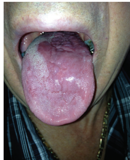
FIGURE 3: Three months after treatment.

The discovery that miltefosine is effective against Leishmania led to the identification of a modern group of antiprotozoal medicines [1]. Following clinical studies, miltefosine was approved as Impavido and has become the first oral treatment for leishmaniasis in some countries [2]. It is an effective treatment for visceral and cutaneous leishmaniasis,