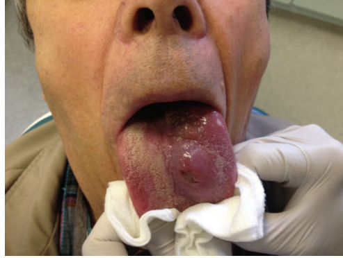
FIGURE 1: Presentation of tongue lesion.