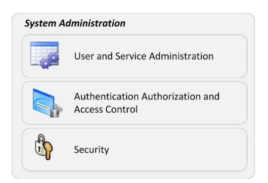
Figure 3. System administration.

System administration will be embedded in the middleware platform and will allow for the platform administration tasks to be conducted across a back office. These administration tasks are shown in Figure 3 and include issues such as user and service administration, security, authentication, authorization, access control, accounting, ciphering information, managing quasi-identifiers, data replication and balanced distribution methods through the cloud.