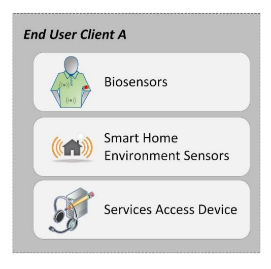
Figure 1. End user client.

The end user client is an input module for the middleware platform. It is structured as three sub-components. As seen in Figure 1, the three sub-components are biosensors, environment sensors and the service access device.