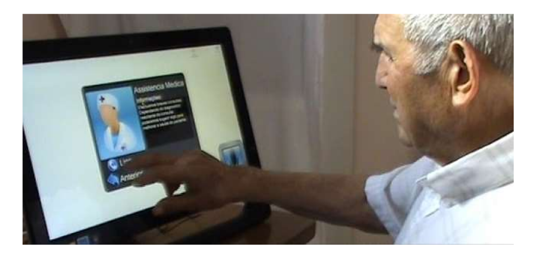
Figure 4. Service doctor appointment in the medical category.

To validate the proposal, a prototype was built, adding three services: one in the medical category, another in the leisure category and a third in the call center category. Figure 4 shows the service that was tailored to provide the ability for the elderly user to make a video call to a doctor (medical category). Figure 5 illustrates a four-player popular card game among the male senior population in Portugal, known as sueca , which was developed and added as a new service (leisure category). Finally, in the call center category, a service was added to allow sending an asynchronous voice message.