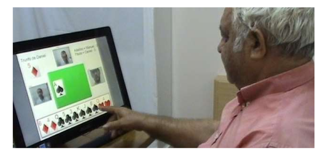
Figure 5. Service sueca card game in the leisure category.

After a brief explanation of the system, acceptance tests were conducted with the consent of the users. First of all, the individuals were invited to perform a video call, play the sueca game and send a voice message. For each of these three tasks, we measured the time to perform each action and the errors/attempts made (following a quantitative perspective). The test protocol consisted of individually observing each subject, where only the user and the observer were present in an isolated room.