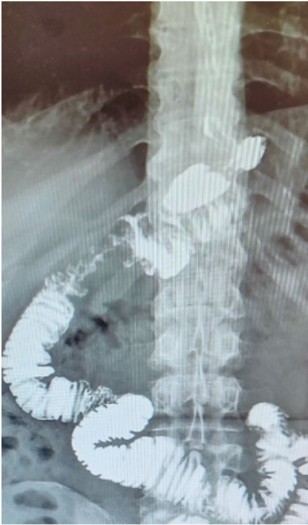
Fig. 1 Upper gastrointestinal series showing the “OAGB in situ” technique. The image showing the gastric tube fixed at right upper quadrant and food stream directly into the efferent loop