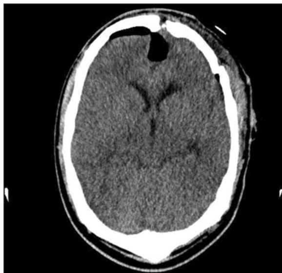
Figure 3 Post-operative computed tomography scan showing successful craniotomy.

Intracranial chondroma has also been reported as a component of Ollier's multiple chondromatosis [9]. Pontine hemorrhage has also been associated with parasellar intracranial chondromas [3]. Association of skull base chondromas has also been reported with Maffucci syndrome [10].