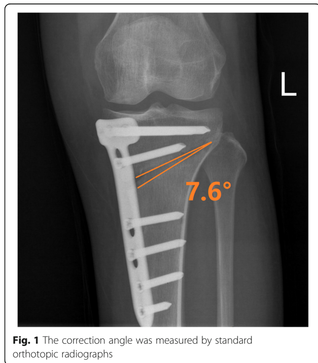
Fig. 1 The correction angle was measured by standard orthotopic radiographs

The Gross formula of calculating HBL is a linear model that accounts for circulating blood volume by using the perioperative mean hematocrit. It was first introduced by Ward [14] and later improved by Gross [15]. The calculation of perioperative blood loss by Gross formula is close to the reality. HCT is the most important reference index to calculate the HBL after BOWHTO. Preoperative HCT of patients is generally stable, but the changes of postoperative HCT vary greatly. At present, some studies suggested that it may be better to choose the 2-3 days postoperative HCT value because it is often the time point where