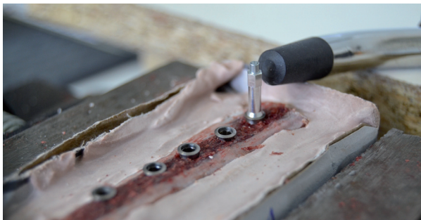
Fig. 3. Implant primary stability measured with resonance frequency analysis (Osstell ISQ).