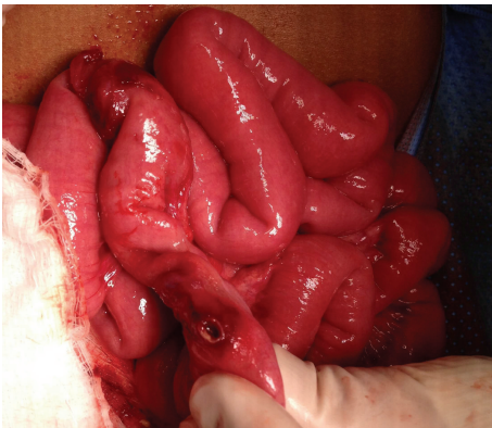
FIGURE 2: Operative findings of the same patient showing loops of jejunum, which were entrapped in between multiple rare-earth magnets resulting in pressure necrosis and bowel perforation.

with no pneumoperitoneum and/or obstructive bowel pattern (Figure 1(b)). After discussion with parents, the child was taken to operating room for laparoscopy and proceeds to remove the magnets. Laparoscopy showed multiple small bowel loops adherent to each other forming a mass in the left upper quadrant. The procedure was converted to open through umbilical port site. On careful examination, it was observed that loops of jejunum are entrapped in between multiple magnetic pieces inside the jejunum resulting in pressure necrosis and perforation of jejunum at two sites (Figure 2). Through this enterotomy site, 14 pieces of magnets were retrieved and the remaining 12 pieces were not palpable in the small and large bowel. A table X-ray showed these missing pieces of magnets in the stomach, which were palpated and retrieved through a gastrostomy. Her postoperative