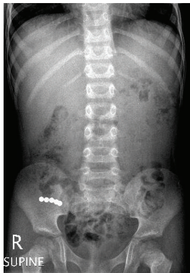
FIGURE 3: Plain X-ray of abdomen of 4-year-old boy showing ingested 5 pieces of rare-earth magnets joined together due to strong magnetic force.