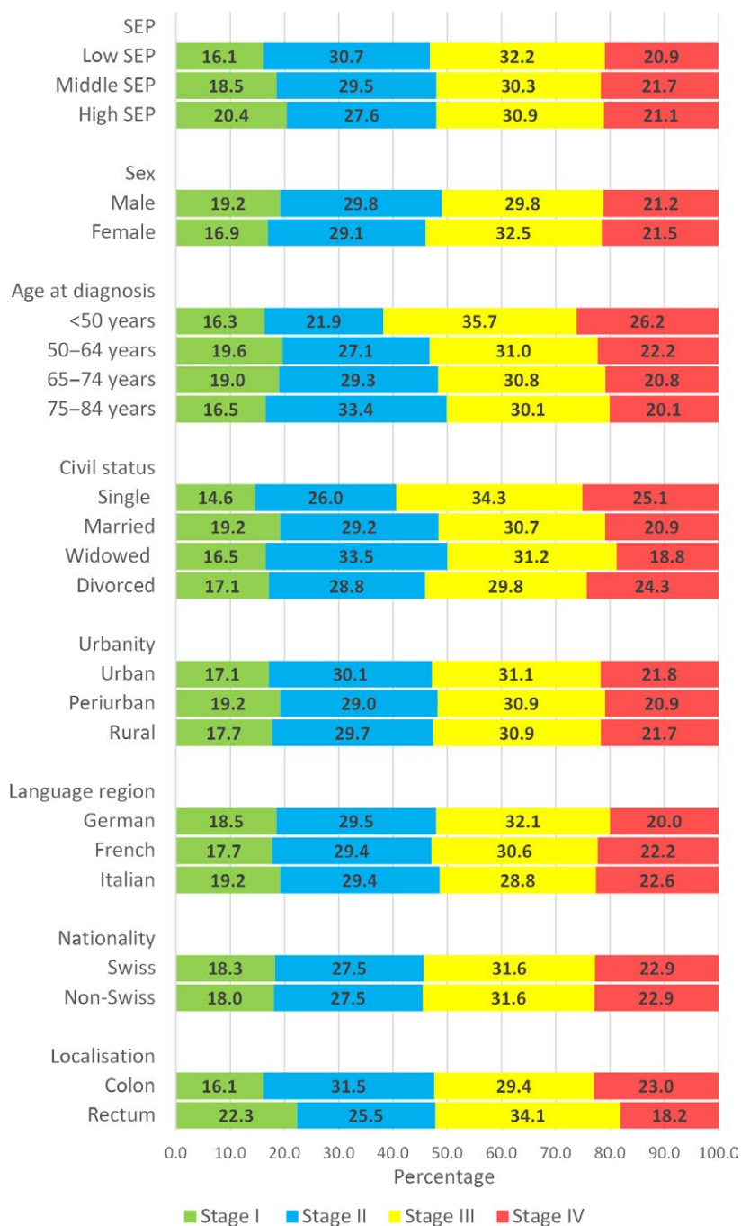
Figure 1. Distribution of colorectal cancer stage at diagnosis by sociodemographic characteristics and tumor localization ( N = 9147 ). The analysis has been restricted to cases with known stage at diagnosis (9147 of 10,088 cases).

disparities did not persist, suggesting that treatment uptake and quality of care did not depend on civil status.