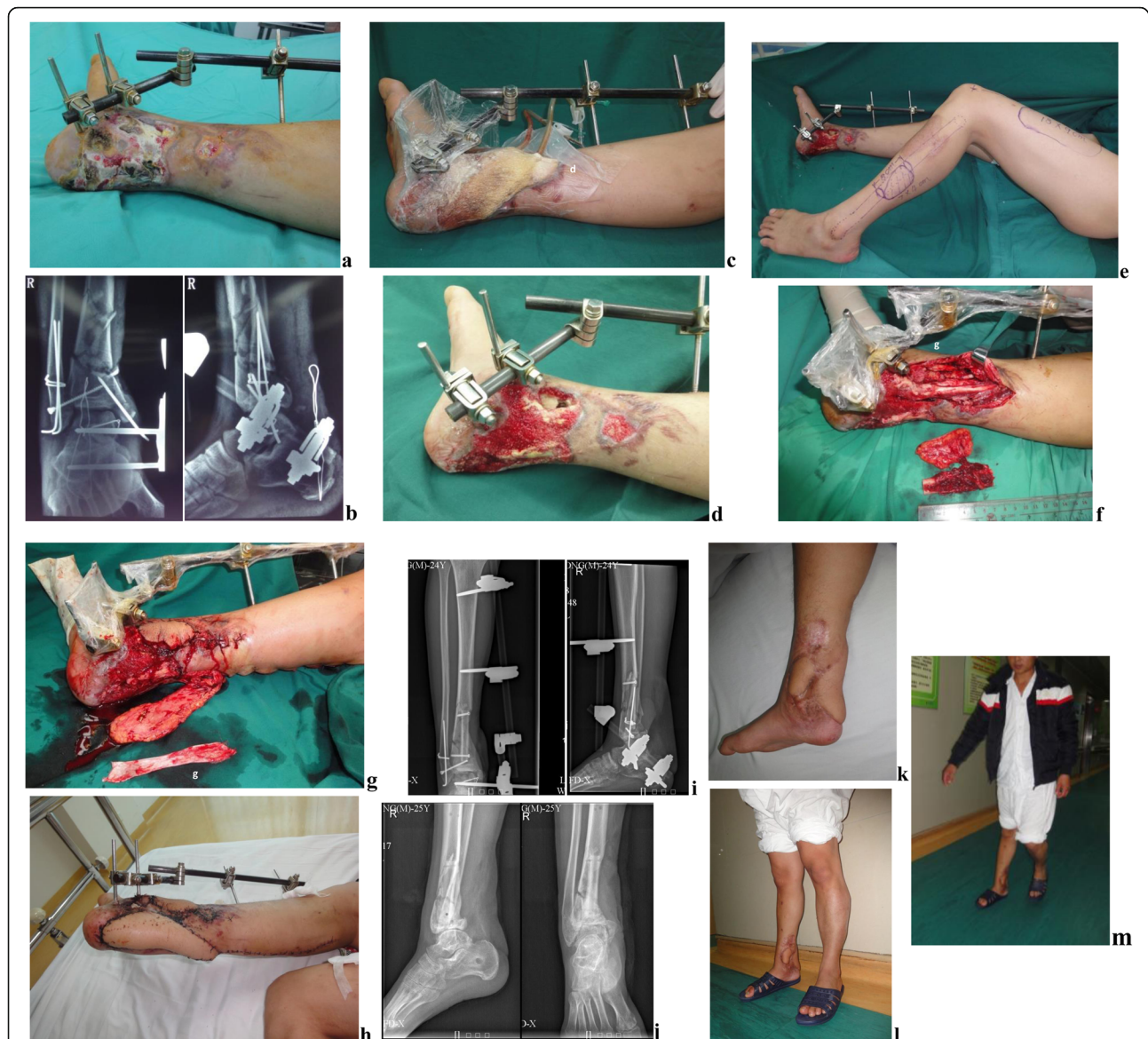
Fig. 1 Case 1. A 24-year-old male patient with multiple fractures of the distal tibia and fibula complicated with soft tissue defects and infection for more than 1 month. Injury was caused by a traffic accident. Bone injury appearance upon admission and X-ray of the ankle joint ( a, b ). After thorough debridement and vacuum sealing drainage (VSD) of the right ankle, the granulation tissues on the wound surface grew well ( c, d ). During the second-stage procedures, FVFG was performed to reconstruct the infected bone defects (approximately 6 cm in size) at the distal tibia. The fascia lata of the same thigh was designed to repair the Achilles tendon defects. Simultaneously, the sural neurovascular flap of the right limb was reversely transferred to repair the Achilles tendon wound. The contralateral fibular bone flap, thigh fascia lata, and the ipsilateral sural neurovascular flap were harvested ( e-g ). Both the fibular flap and sural neurocutaneous flap survived well, and the wound was healed without exudation after operation ( h ). Postoperative X-ray showed that the FVFG repaired the distal tibial defects with excellent alignment ( i ). External fixator was removed 6 months postoperative and partial weight-bearing walk under the protection of the brace. At 1 year after operation, the internal fixator was removed, and normal walking function was restored. ( j-m ). After 24 months of postoperative time, the ASAMI functional score of the affected extremity was excellent, with an external fixation index 1.0

Kirschner wires alone, which can then be protected by a transarticular external fixator for a short period of time, thus reducing the influence on activities of adjacent joints. Second, FVFG is appropriate when the infection site is large or the bone defects are long, especially for cases with an unclear range and margin of infected