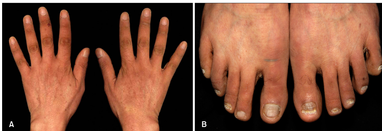
Fig. 1. Velvety, ill-defined hyperpigmentation and papillary hypertrophy are seen at the joints of the fingers (A) and toes (B).