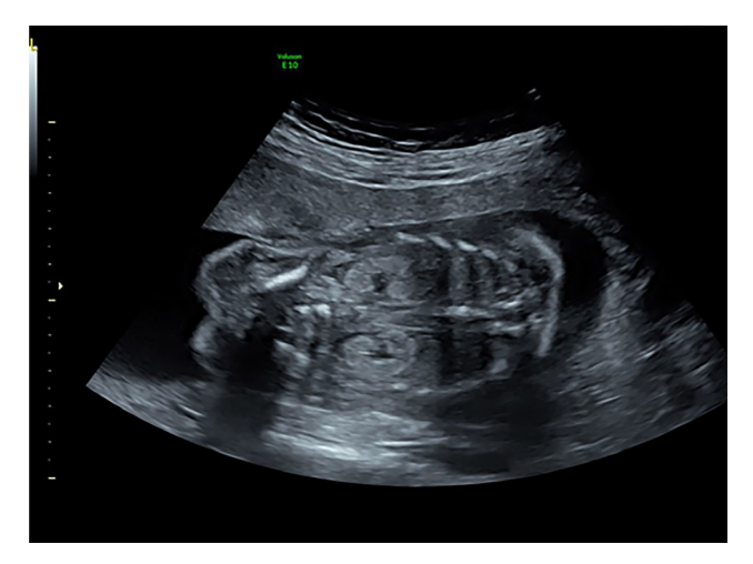
Figure 1 | Renal ultrasound showing a hyperechogenic cortex.

MODY5, also known as renal cysts and diabetes syndrome, has a 50% chance of being passed on to offspring. HNF1B -related renal dysfunction could present in renal cysts and diabetes syndrome, which would lead to a poor prognosis. As for pregnant MODY5 patients, adverse outcomes during pregnancy could affect both