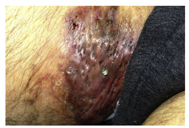
Fig 1. In a patient with HS, infiltrated inflammatory plaque affecting inguinal area.