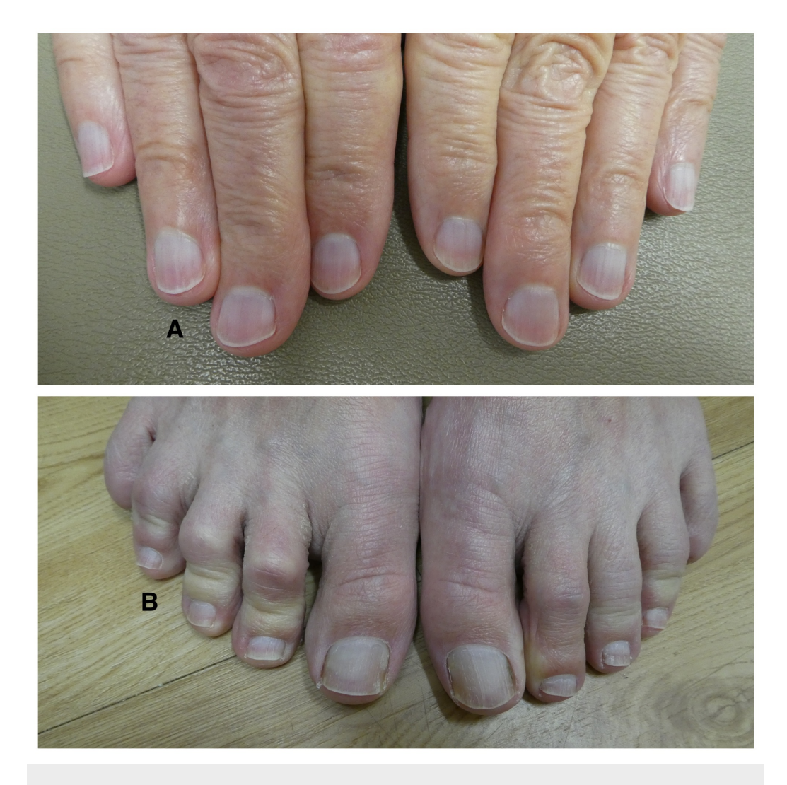
FIGURE 1: Congenital leukonychia of the fingernails and toenails

The fingernails (A) and toenails (B) of a 75-year-old man show diffuse whitening that has been present since childhood consistent with idiopathic leukonychia.