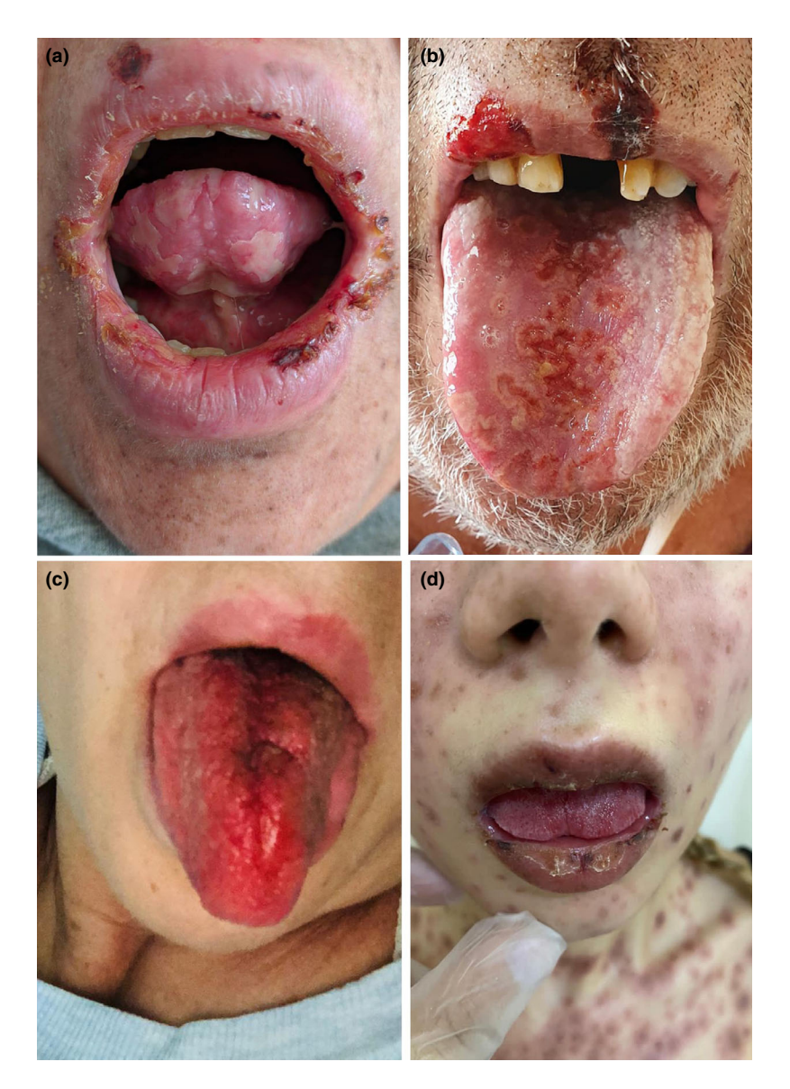
Figure 1 SARS-CoV-2 confirmed cases with oral mucosa findings. (a) A 47-year-old woman with a maculopapular rash on admission developed erosions under the tongue and ulcers in the oral mucosa 3 days after diagnosing COVID-19. (b) A 78-year-old man developed herpetiform ulcers unresponsive to valacyclovir on the tongue 10 days after diagnosis. Herpes simplex type I IgM was negative, and IgG was positive with a low titer, and herpes simplex type II IgM and IgG were negative (c). A 53-year-old woman developed a red, edematous painful tongue 4 days after PCR and chest CT confirmation of COVID-19. (d) A 25-year-old woman with fever and a maculopapular rash developed cracked lips and erosions on the buccal mucosa. Herpes simplex type I and II antibodies were negative, and repeated SARS-CoV-2 PCR was positive on the 7th day of admission

disease. Furthermore, many publications have reported on the effect of altered health status in oral mucosa, including the effects of concurrent infections and related conditions, without focusing on the direct impact of viral infection. The concurrent infections considered included herpes simplex virus, candida, and mucormycosis, and concurrent non-infection conditions considered included drug use (antiplatelet, antibacterial drugs) in addition to other related factors.<sup>6</sup> In this review, we searched the literature in detail for specific manifestations of COVID-19 in