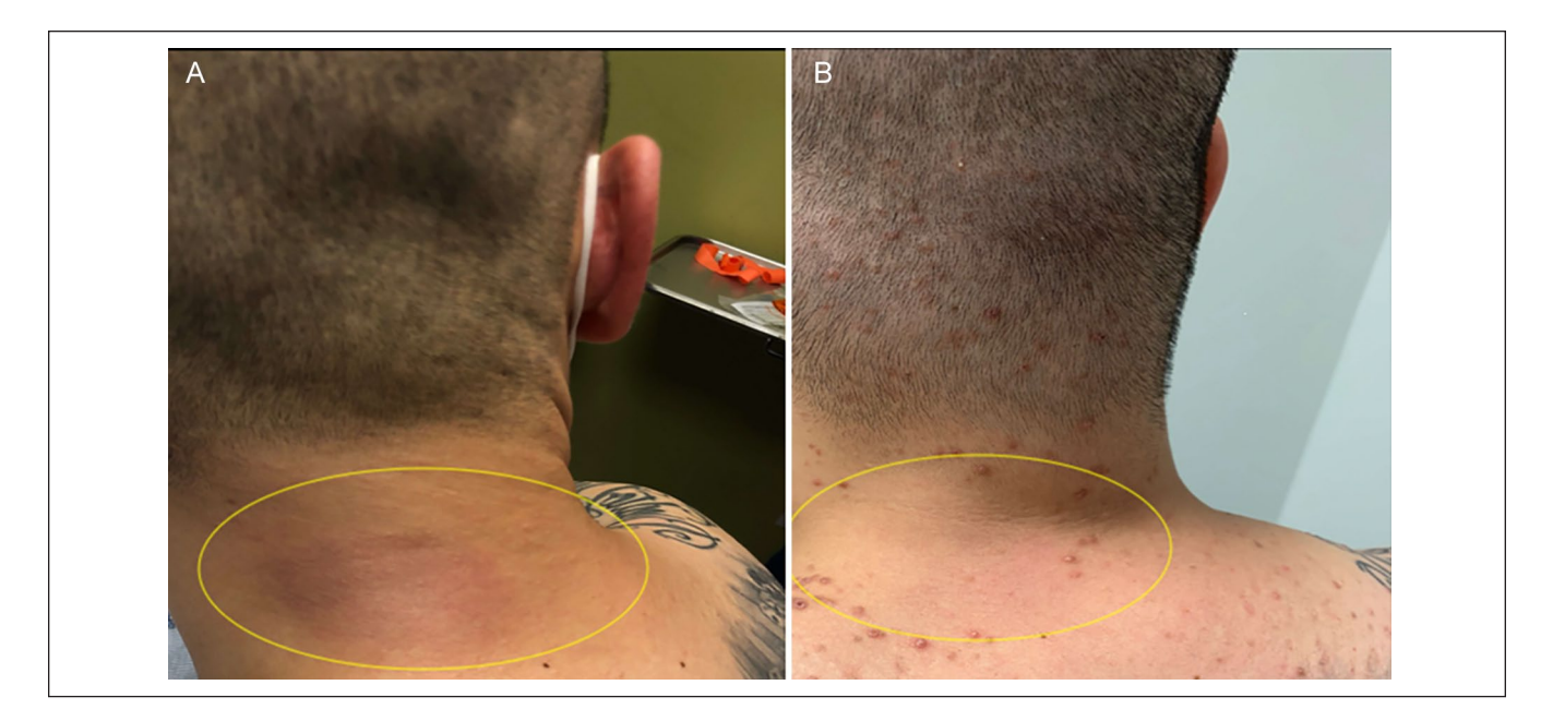
Figure I. (A) Patient's posterior neck nodule before treatment. (B) Patient's posterior neck nodule after 3 months of treatment.

show remission in patients with less toxic immunosuppressive regimens.<sup>4,5</sup>