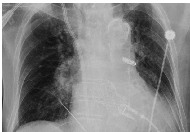
Figure 1 Chest radiograph. The Micra leadless cardiac pacemaker (Medtronic Inc, Minneapolis, MN) is dislodged to the left pulmonary artery.

significantly lower than lead dislodgement with conventional pacemakers. Small studies reported a 0.13% incidence of Micra TPS dislodgement while the reported incidence was higher with Nanostim (1.1%) 6 (Abbott Inc). The reason for this device dislodgement is unclear. Even though the pacing threshold was suboptimal at 2 V @ 0.24 ms, the location of the Micra TPS and sensing at this location were acceptable and the pull and hold test was successfully performed before the tether was cut.