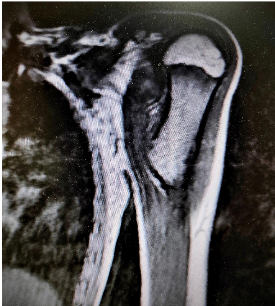
FIGURE 2: Left shoulder MRI showing a 4-cm bony protuberance covered by a 4-mm cartilage cap (osteochondroma).

According to the Radiology Department's report, the lesion had features of an osteochondroma without malignant characteristics. However, imaging could not rule out a primary malignant bone tumor. The thorough clinical and radiographic evaluation did not show multiple hereditary exostoses. After explicitly discussing the treatment options with the patient and his family, an excisional biopsy was suggested. However, the patient's family refused to proceed to any intervention and did not return for follow-up.