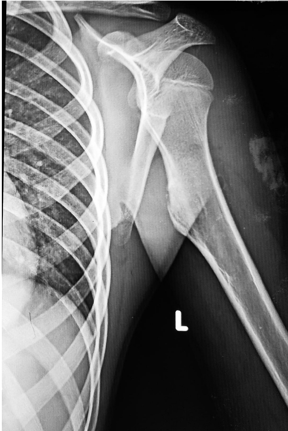
FIGURE 1: Left shoulder X-ray showing the presence of a sessile osteochondroma of the left proximal humerus at 11 years of age.

Magnetic resonance imaging (MRI) examination revealed a 4-cm triangular bone protuberance surrounded by a 4-mm cartilage cap, without enhancement after intravenous contrast agents administration (Figure 2).