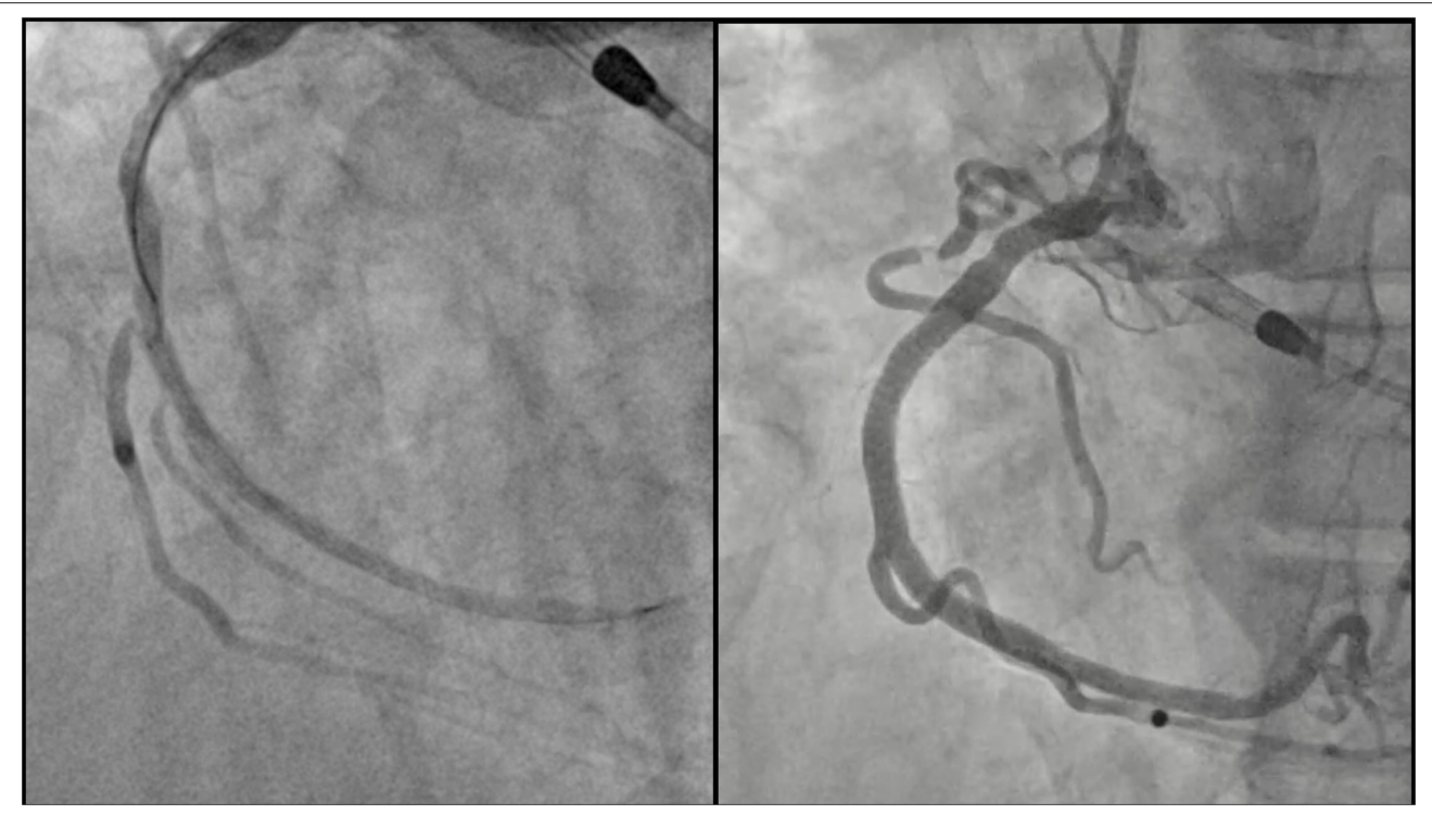
FIGURE 4 | Right coronary artery after PCI. Left panel : result after predilatation. A severe stenosis of the marginal branch ostium is shown. Note the Supercross 120° microcatheter that was used to wire the branch. Right panel : final result after deployment of the Tryton side branch stent in the marginal branch and multiple drug-eluting stent implantation in the right coronary artery.