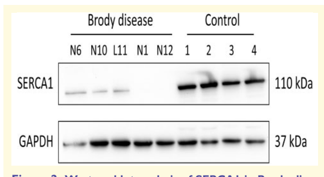
Figure 2 Western blot analysis of SERCAI in Brody disease and control. All Brody disease samples demonstrated severely reduced or absent SERCAI protein content. See Supplementary material for full gels.

patients carrying 19 novel mutations plus the 18 previously published patients. The findings classify Brody disease as a distinct myopathy in the broader field of calcium-related myopathies.