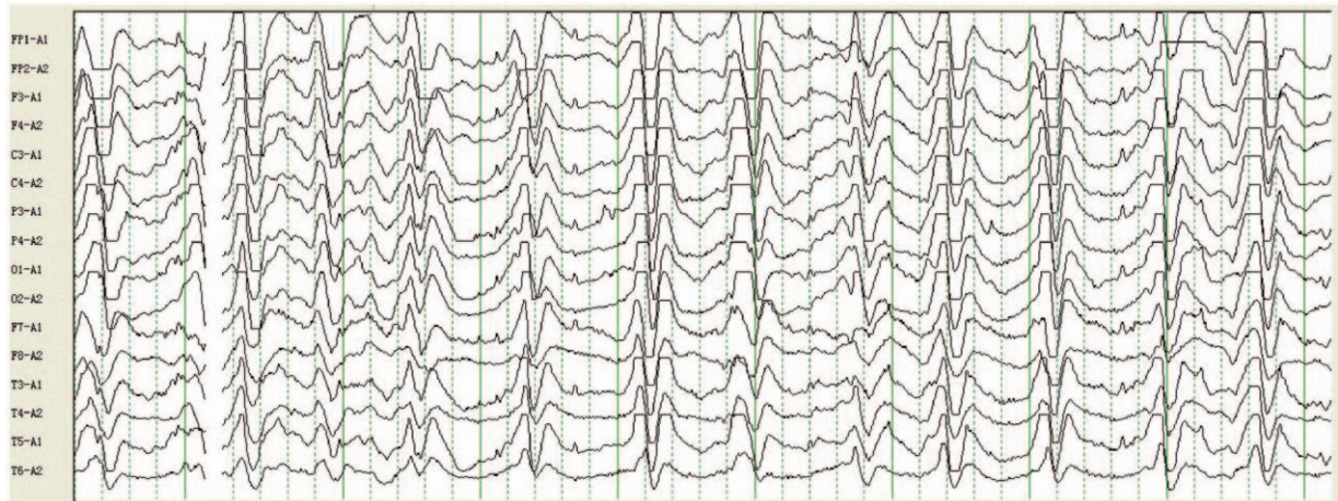
Figure 2. The EEG of the patient showed synchronous extensibility and high amplitude (2–2.3Hz) of a triphasic sharp wave that continued to appear under the background of diffuse low amplitude activity, which was symmetry and could be observed bilaterally. EEG = electroencephalography.

experienced recurrent dizziness as the initial symptom, which is atypical and easily misdiagnosed. After half of a month, the patient appeared progressive deterioration in cognitive abilities, which is the classical symptom of sCJD, and quickly fell into a coma before been transported to the hospital. After admission, we performed MRI and EEG tests. Based on the clinical manifestation and the results of the MRI and EEG tests, we have taken the possibility of sCJD into account. Therefore, for the diagnosis of CJD, a doctor’s awareness of this disease is of great significance.