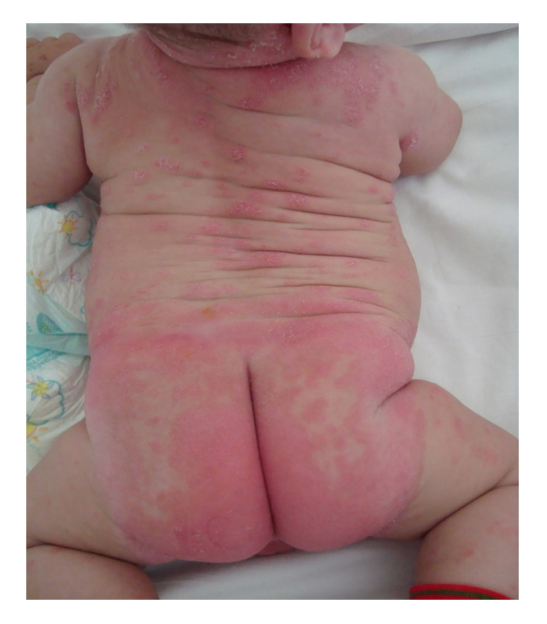
Figure 7. Napkin psoriasis.

lichen planus (2,27,28). Psoriasis can be mistaken with seborrheic dermatitis and avitaminosis, but they can also coexist. Just like in adults, the association with atopic dermatitis is frequently seen in children. In terms of association with systemic diseases, children with psoriasis have a higher rate of obesity, especially boys. Patients with this comorbidity are more likely to have a severe form of psoriasis compared to normal-weight psoriatic children (29). The major comorbidity is psoriatic arthritis. Prevalence in the children population is still unknown. Psoriatic arthritis can occur at any age, but the onset is more common between 2 and 3 years and 9 to 12 years of age. This condition causes joint pain and mostly affects finger and toe joints (30,31). Younger children with psoriasis, especially girls, present an onset with an oligoarticular disease