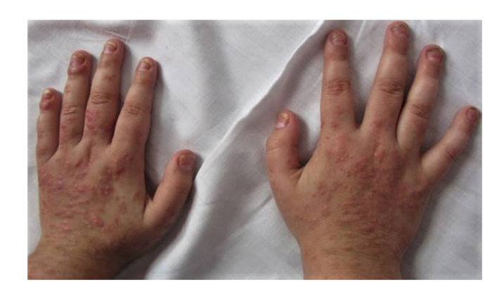
Figure 10. Nail psoriasis.

between 12 and 58% (36,37) and even up to 81.4% in more recent studies (38). The eyelid manifestations include blepharitis, which is the most frequent one, together with erythema, psoriatic plaques, and edema leading to eyelid abnormalities such as ectropion, trichiasis, and madarosis. In moderate and severe forms of the disease, chronic conjunctivitis can lead to limbal lesions and keratoconjunctivitis sicca further responsible for corneal lesions such as punctate keratitis, recurrent erosions, opacities, and vascularization (39). The anterior uveitis associated with childhood psoriatic arthritis and onset before the age of 6 years has been described as bilateral, long-lasting, and severe requiring biologic therapy (40).