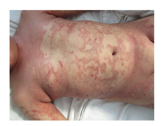
Figure 11. Pustular psoriasis.