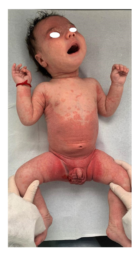
Figure 6. Napkin psoriasis.

lichen planus (2,27,28). Psoriasis can be mistaken with seborrheic dermatitis and avitaminosis, but they can also coexist. Just like in adults, the association with atopic dermatitis is frequently seen in children. In terms of association with systemic diseases, children with psoriasis have a higher rate of obesity, especially boys. Patients with this comorbidity are more likely to have a severe form of psoriasis compared to normal-weight psoriatic children (29). The major comorbidity is psoriatic arthritis. Prevalence in the children population is still unknown. Psoriatic arthritis can occur at any age, but the onset is more common between 2 and 3 years and 9 to 12 years of age. This condition causes joint pain and mostly affects finger and toe joints (30,31). Younger children with psoriasis, especially girls, present an onset with an oligoarticular disease