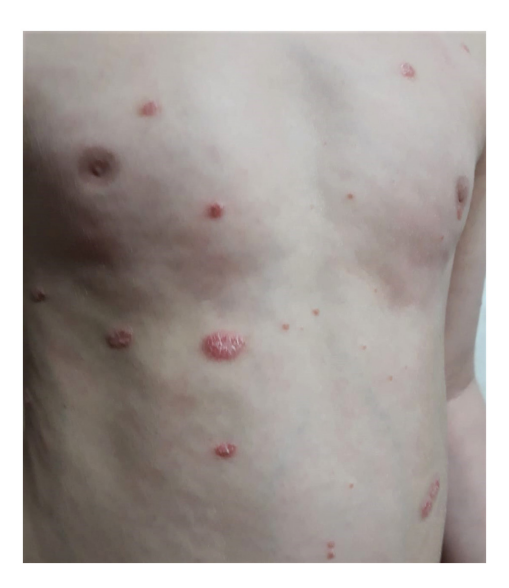
Figure 4. Guttate psoriasis.

has well-defined, scaly, erythematous, and pruritic lesions. In children with alopecia, the hair grows back when the disease is under control (2). Nail psoriasis is less frequent in children compared to adults but can be observed in approximately 40% of the children. The most common changes are pitting, leukonychia, and longitudinal ridges that are very difficult to treat (2,25,26) (Fig. 10). Pustular psoriasis is rare and consists of sterile superficial pustules with annular disposition (Fig. 11). If pustules are generalized, children may develop a fever and they may be often mistaken for an infection. Another variant of this disease is erythrodermic psoriasis (Fig. 12) that affects more than 90% of the body surface and is extremely rare (2,16).