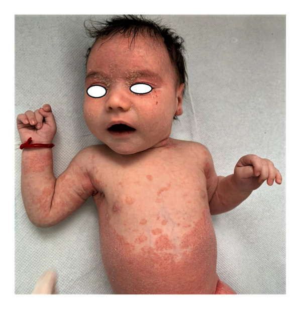
Figure 1. Facial lesions in napkin psoriasis.