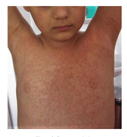
Figure 9. Guttate psoriasis.