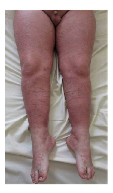
Figure 15. Post dermocorticoid striae in psoriasis.

Phototherapy . Phototherapy [narrow-band ultraviolet B (NB-UVB); psoralen plus ultraviolet A (PUVA)] is an alternative therapy for children with chronic plaque or guttate psoriasis that have an unsatisfactory result to topical treatment. Side effects of phototherapy in children include erythema, burning, hyperpigmentation, viral reactivation, and risk of cutaneous