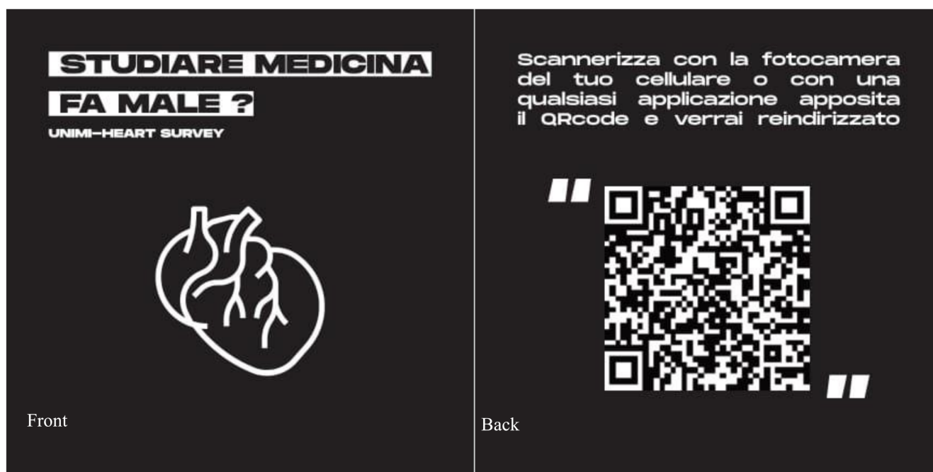
Figure 1. QR code flyer. Front and back of QR code flyer delivered to the students.