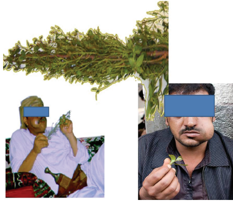
FIGURE 1: Khat tree and how khat users chew and keep it for few hours in their mouth cavity.

Khat contains several components, mainly a monoamine alkaloid called cathinone, which is an amphetamine-like stimulant that is responsible for most effects of khat, including excitement, loss of appetite, and euphoria [10, 11].