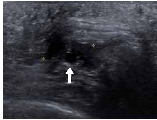
Figure 2. Ultrasound scan of the same patient showing a 12 mm hypoechoic mass in keeping with a Morton's neuroma-bursal complex in the 2 nd web space

As far as the authors are aware, this study is the first to examine the sensitivity and specificity of CT for MNBC. Prior evidence for the use CT in the detection of MNBC in the literature is limited. Turan et al. in 1991 investigated 15 patients who were clinically suspected to have MNBC and analysed their CT imaging features [7]. MNBC was detected on CT in 7 cases which were all confirmed at Surgery. It is not possible to examine the sensitivity and specificity of CT from Turan et al. , due to the absence of any measure of identifying neuromas in the non-surgical group.